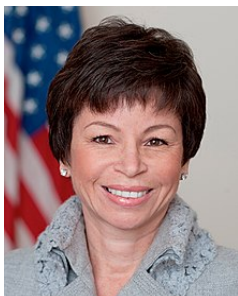
Senior Advisor to the President